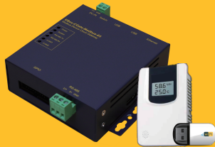
CGate-Warehouse-01 (Small field)