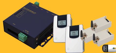
CGate-Warehouse-02 (Large field)

Just fix the device, power distribution and then it can work